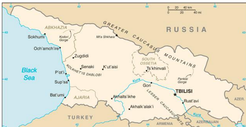
Map: CIA World Factbook

The Georgian language uses a unique script, where every letter looks a bit like the number 3. For example, water is pronounced ts'q'ali and would be written წყალი