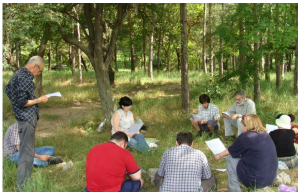
Georgian Friends on an Alternatives to Violence Project (AVP) exercise.

The 2015 Spring Gathering will be taking place from the 4 th -11 th April somewhere in Georgia – exactly where is still to be confirmed!