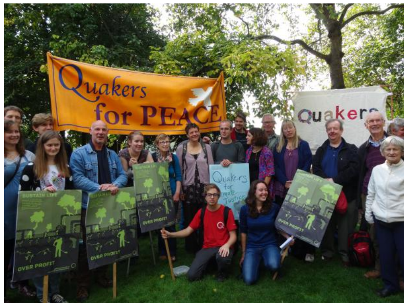
Quakers at the People's Climate March, London 21st September